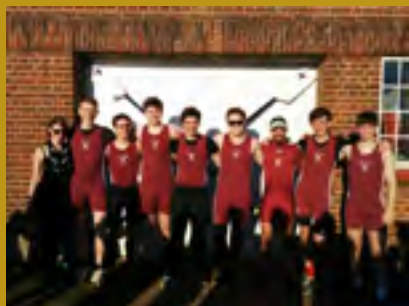
M1 at the Merton Boathouse.