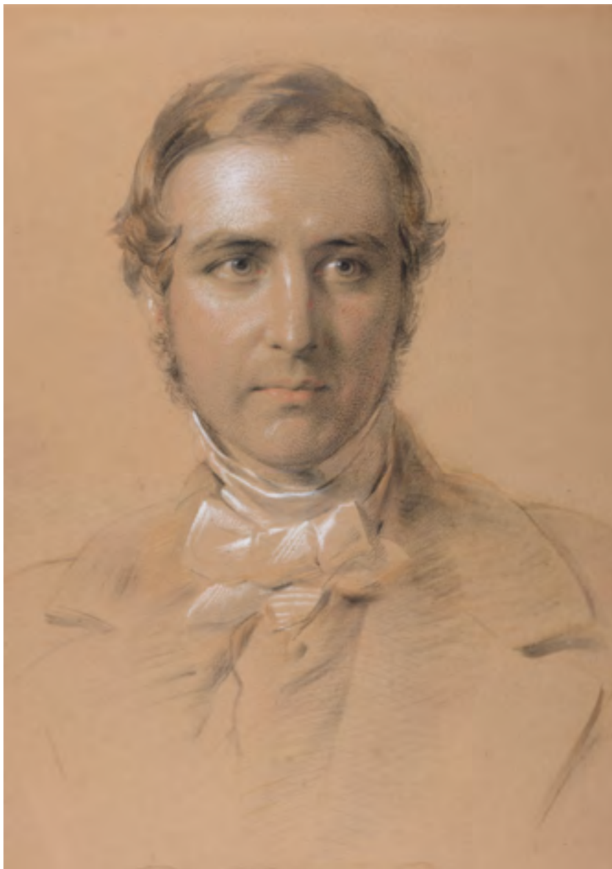
John Coleridge Patteson (1827-1871) by George Richmond, 1854.

The news of Patteson's death caused a national sensation in England. It was believed to be linked to the nefarious