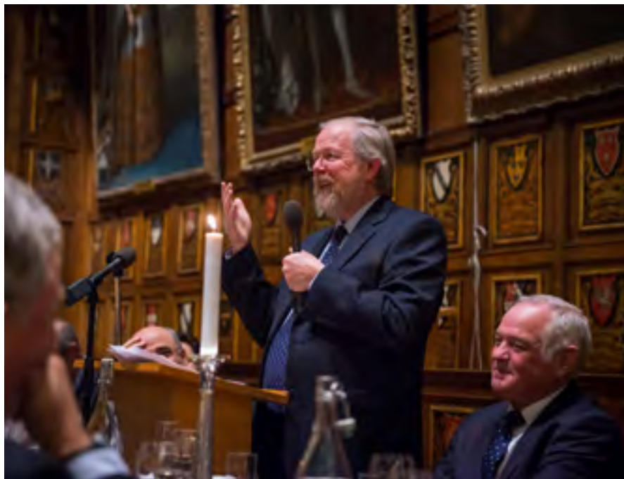
The Warden listens to Bill Bryson speaking at the final Anniversary Campaign Dinner in London in December 2014.