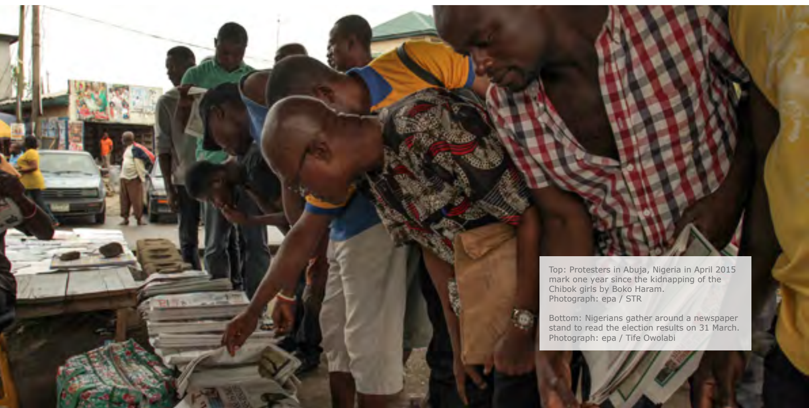
Top: Protesters in Abuja, Nigeria in April 2015 mark one year since the kidnapping of the Chibok girls by Boko Haram.