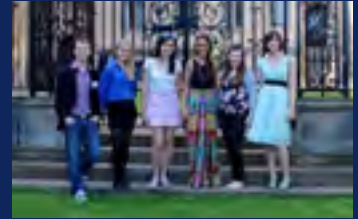
Recently graduated Mertonians return to Merton to provide Careers advice.

You can also contact alumni@careers.ox.ac.uk with any questions or to receive a monthly alumni careers newsletter.