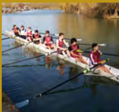
M2 on the start line at Torpids.