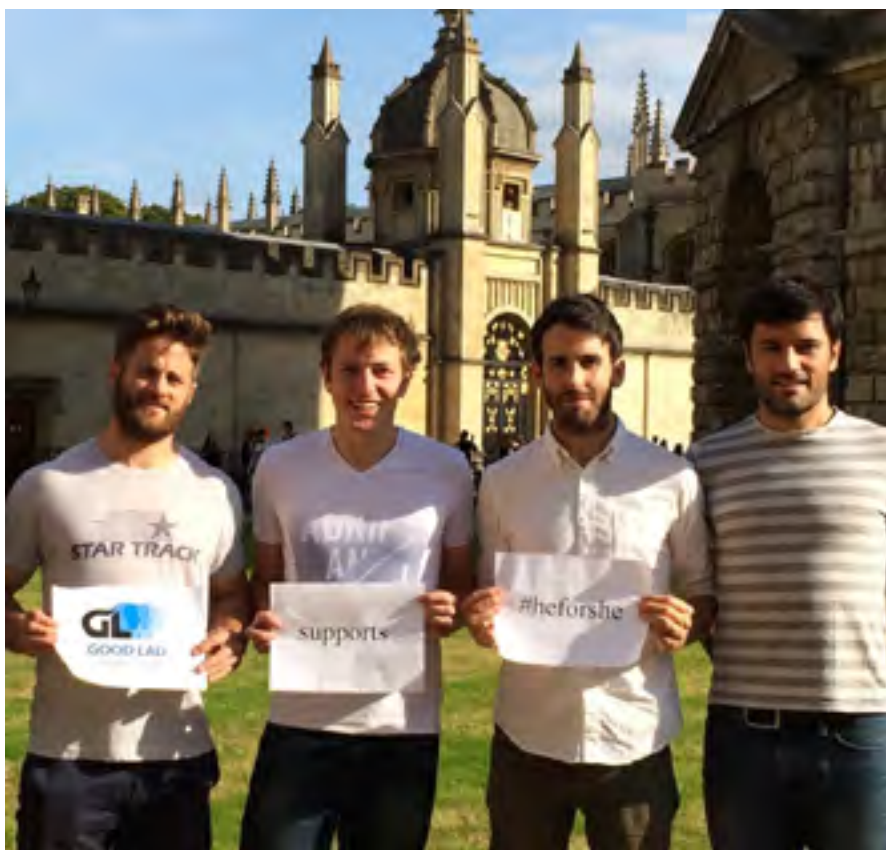
Good Lads in Oxford on International Women's Day, March 2015.

The more they discussed, the clearer it became that there is a need for non-judgemental space to express and encourage 'positive masculinity'. The Good Lad workshops take the line that most young men are 'good guys' and provide groups of young men with the space to talk about behaviour in an open setting for an hour at a time. No answers are provided, but the workshops provide a space for the participants to discuss subjects including, crucially, the way participants' behaviour changes in certain group situations and how to challenge this behaviour in an effective manner.