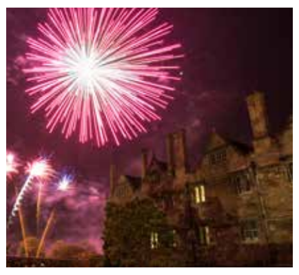
DEVELOPMENT NEWS: MERTON CELEBRATES RAISING £30M TO HELP SUSTAIN EXCELLENCE Page 4