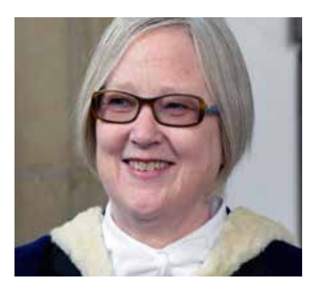
COLLEGE NEWS: MERTON TUTORS WIN AT THE UNIVERSITY'S TEACHING AWARDS Page 2