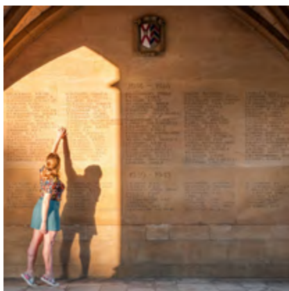
One of Vinesh Rajpaul's winning photographs 'We will remember them'