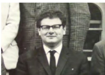
Sir Martin Gilbert in 1966