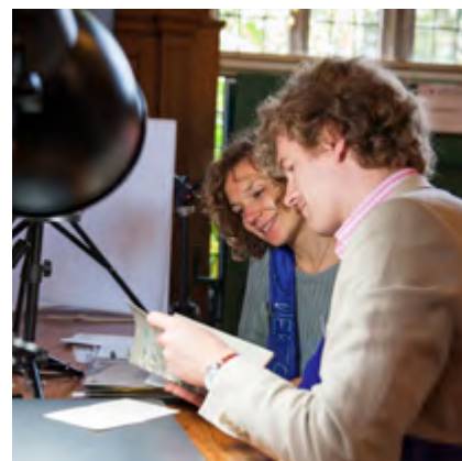
Capturing Merton memories for the Merton@750 project