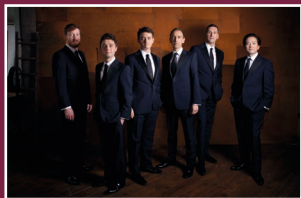
The King's Singers