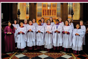
Merton College Girl Choristers