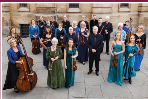
Instruments of Time & Truth