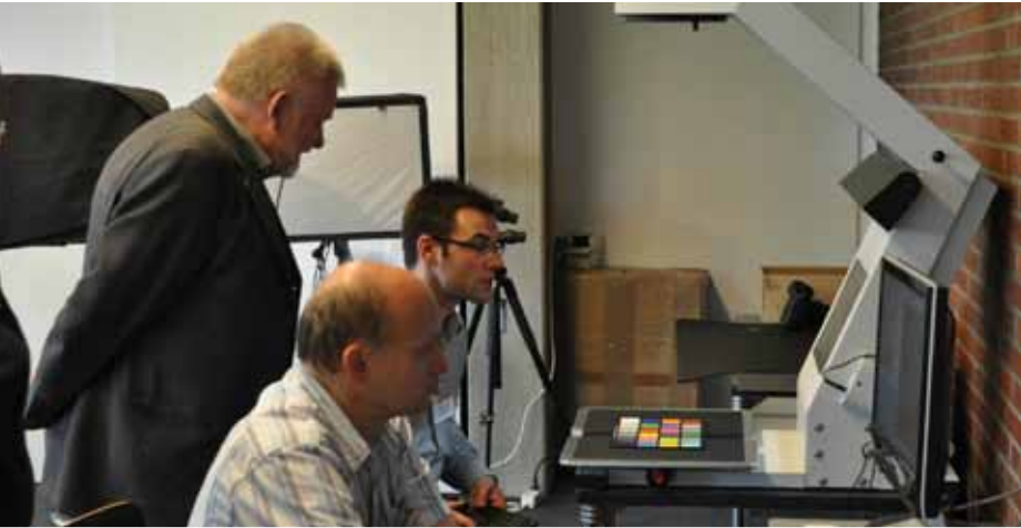
Volunteers hard at work digitising participants' old photos, letters and memorabilia.

Whilst in College for the Birthday Weekend, why not make one or more of these Merton themed activities a feature of your visit?