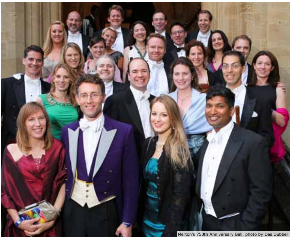
Merton's 750th Anniversary Ball