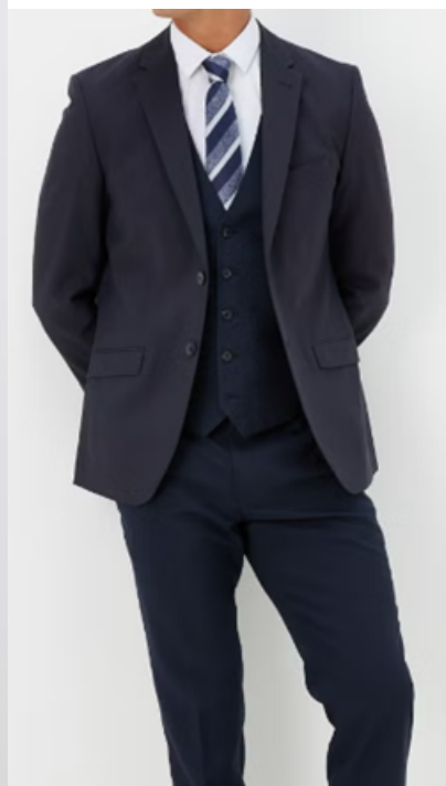
Dark Navy, almost black