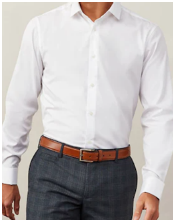
Plain white shirt, with a collar and white buttons