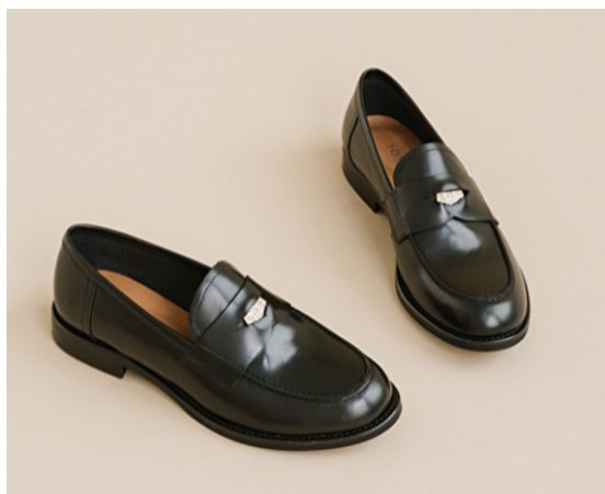
Extremely small embellishments are allowed.