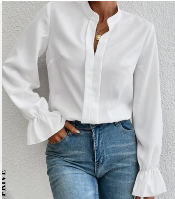
Must have a collar, with tie/ribbon underneath