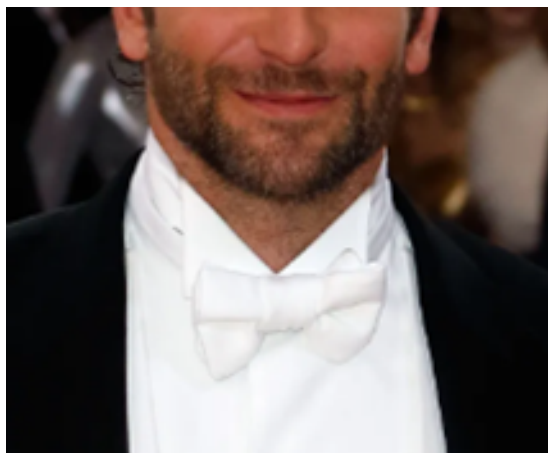
White bow tie