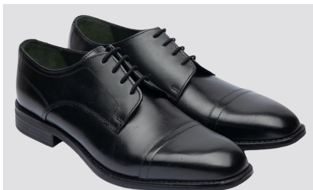
Plain black shoes.