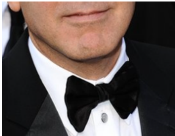
Black bow tie