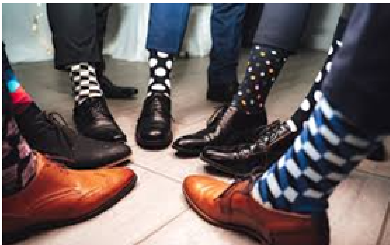
No colourful or patterned socks