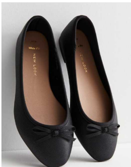
Must have a back.