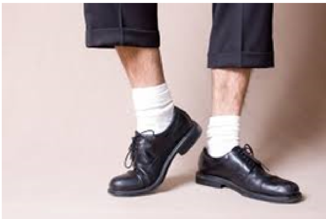
No white socks or bare legs/ankles