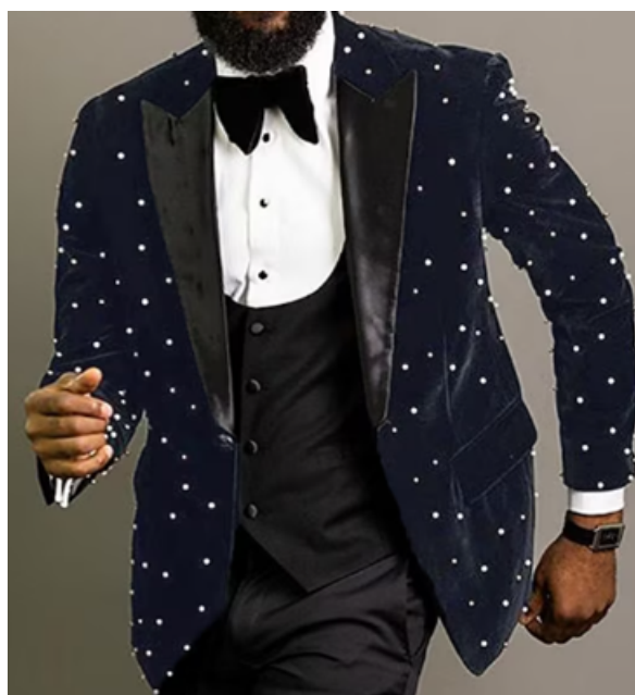
Polka dots or any decorations No other colours