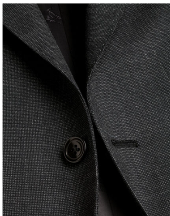
Very dark charcoal