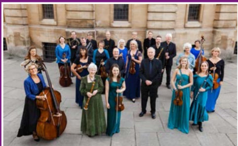
Instruments of Time and Truth