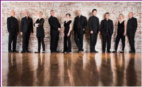
The Cardinal's Musick