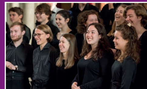
Merton College Choir

10.30 Procession and Sung Eucharist of the Lord's Passion Langlais Messe Solennelle Byrd Ave Verum Corpus