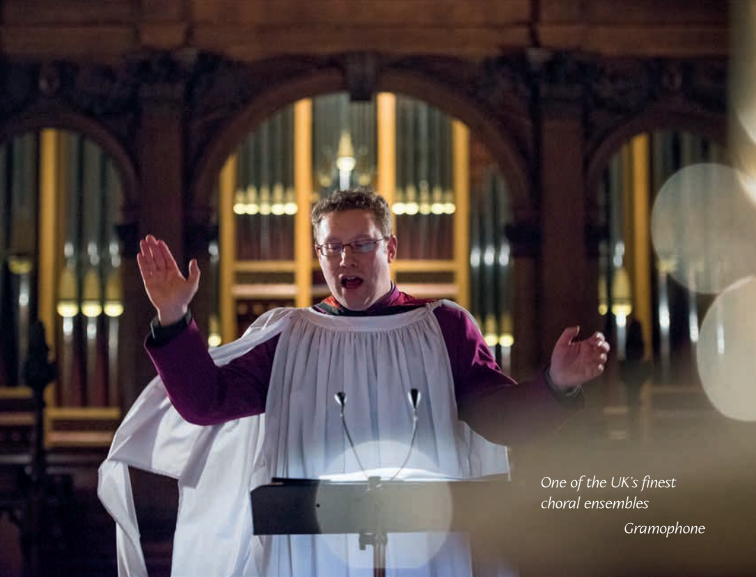
One of the UK's finest choral ensembles Gramophone

Merton College is synonymous with the highest quality music, not least because the College Chapel is one of the greatest spaces in the city for choral music. The Choir of Merton College now boasts an international reputation as one of Oxford's best mixed-voice choirs, and it has been a joy and a privilege to play a role in its burgeoning success.