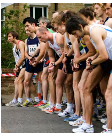
Runners at the startline of the Oxford Town & Gown 10k.