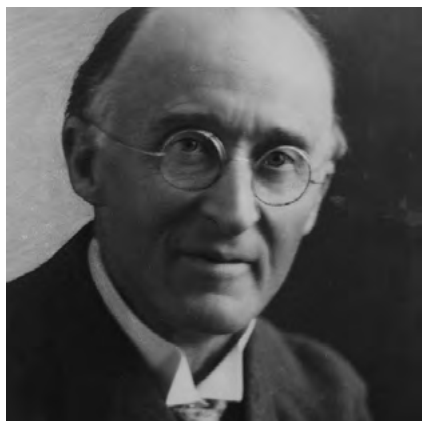
Frederick Delius by Elliott & Fry. Photograph © National Portrait Gallery, London (licensed under CC BY-NC-ND 3.0)