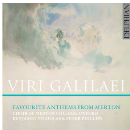
Viri Galilaei: Favourite anthems from Merton. Released 18 March by Delphian Records.