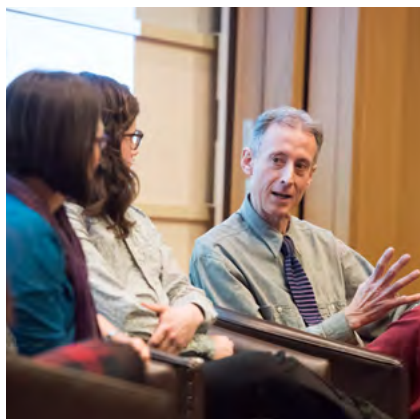
Peter Tatchell and panellists at the third Merton Equality Conversation.