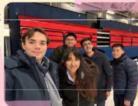
ICE SKATING TRIP!

THE BENEFIT OF BEING ONE OF THE SMALLER COLLEGES IS THAT MERTON HAS A REAL COMMUNITY FEEL WHICH MEANS THAT YOU WILL ALWAYS BE ABLE TO GET THE SUPPORT YOU NEED! THERE'S SUPPORT AROUND YOU EVERYWHERE AT COLLEGE – JUST REMEMBER TO ASK!