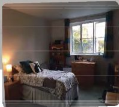
ROSE LANE ROOM

THIS MEANS YOU GET TO LIVE WITH YOUR FRIENDS AFTER FIRST YEAR! SECOND AND FOURTH YEARS LIVE ON HOLYWELL STREET, ABOUT A 5 MINUTE WALK FROM COLLEGE, IN A VERY PRETTY PART OF OXFORD! IT'S AROUND THE CORNER FROM THE RADCLIFFE CAMERA ( THE ICONIC CIRCULAR LIBRARY ) AND IN A VERY CENTRAL AREA. HOLYWELL STREET ACCOMMODATION IS ESSENTIALLY A CHANCE TO LIVE IN A SHARED HOUSE, WHILST STILL ENJOYING THE AFFORDABLE COLLEGE RENT, HAVING CLEANING SERVICES, AND HAVING LAUNDRY FACILITIES NEARBY. EACH HOUSE HAS A WELL-EQUIPPED KITCHEN AND IS AROUND A 5 MINUTE WALK FROM COLLEGE.