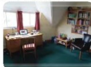
THIRD YEAR ROOM

MERTONIANS GENERALLY AGREE THAT THE ACCOMMODATION IS REASONABLY PRICED, OF A VERY GOOD STANDARD, COMPARING FAVOURABLY WITH UNIS ACROSS THE SOUTH EAST. THE ACCOMMODATION ALSO MAKES IT VERY EASY TO MAKE FRIENDS - I AM CLOSE FRIENDS WITH MANY PEOPLE FROM MY FIRST YEAR ACCOMMODATION IN ROSE LANE!