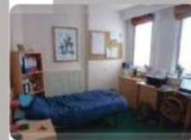
SECOND YEAR ROOM

IN THE YEAR IN WHICH YOU SIT YOUR FINAL EXAMS ( THIRD YEAR FOR MOST ), YOU HAVE THE CHOICE OF MOVING BACK INTO COLLEGE TO LIVE IN ONE OF THE HISTORIC QUADS, INCLUDING MOB QUAD ( THE OLDEST QUAD IN OXFORD! ) MOST ROOMS COME AS A 'SET' SO YOU MAY BE LUCKY ENOUGH TO GET A BEDROOM, STUDY AND ENSUITE TO GET YOU THROUGH FINALS!