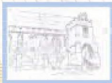
ENTRANCE TO HALL

11) THE TABLE IN FELLOW'S GARDEN IS SAID TO HAVE INSPIRED C.S. LEWIS TO CREATE 'THE STONE TABLE' IN THE CHRONICLES OF NARNIA .