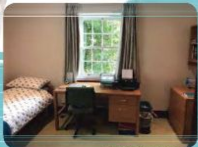
MERTON STREET ROOM

MERTON IS A VERY CENTRALLY LOCATED COLLEGE, WITH THE HIGH STREET ONLY A FIVE TO TEN MINUTE WALK FROM ALL ACCOMMODATION.