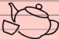
WAFFLE MAKING AT WELFARE TEA:

SECOND OF ALL, ANOTHER REALLY IMPORTANT ASPECT OF OUR JOB IS TO PROVIDE AND COORDINATE PEER SUPPORT ACROSS THE COLLEGE. WE'RE PEER SUPPORT TRAINED OURSELVES TO HELP STUDENTS ASSESS AND EVALUATE THEIR OWN THOUGHTS. WE ALSO ARRANGE PEER SUPPORT TRAINING FOR OTHER JCR REPS, AND CAN ALSO POINT YOU TO OTHER SOURCES OF HELP LIKE OUR WONDERFUL WELFARE ADVISOR, HEAD OF WELFARE, COLLEGE NURSE, UNIVERSITY COUNSELLING SERVICES, AND COLLEGE DOCTOR.