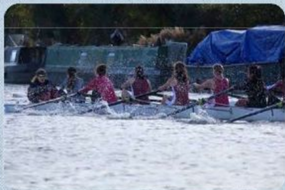
WOMEN'S ROWING TEAM

MERTON'S REPUTATION OF HOLDING OUR ACADEMIC SUCCESS ABOVE ALL ELSE IS ENTIRELY MISLEADING. IN REALITY, OUR COLLEGE SPORTS SCENE IS WHAT IT'S REALLY ALL ABOUT. CAN ANY OTHER COLLEGE CALL THEMSELVES SQUASH CUPPERS CHAMPIONS 2021? AND THIS IS ONLY THE TIP OF THE ICEBERG OF MERTON'S SPORTING OPPORTUNITIES.